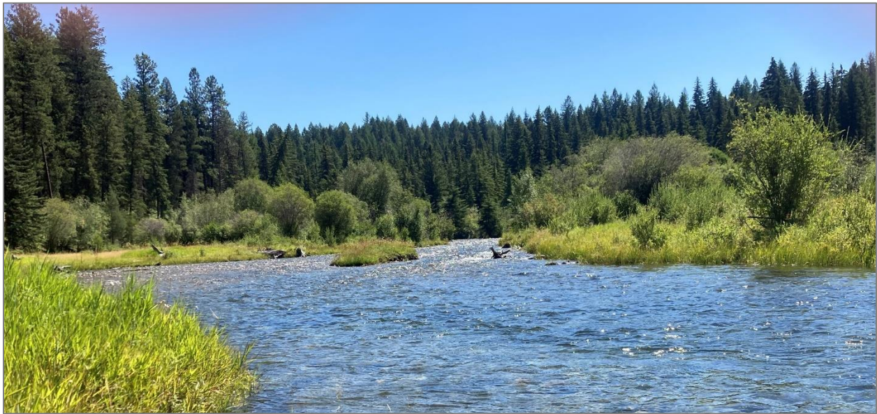
Figure 2. The delta zones where streams outflow into reservoirs are often ecologically enriched. Some delta zones may deserve protection such as that of Kikomun Creek , which flows into Koocanusa Reservoir (below). Kikomun Creek Provincial Park was established along with the Koocanusa Reservoir filling in 1972, but the namesake creek was not included within the park. It's conservation such as through Park expansion or with other measures could be worthwhile.

These ecological enhancement applications with the Duncan and Libby Dams provide guidance for dam operations to enhance ecosystem functions for the Mica and Keenleyside projects along the Columbia River. FRW regimes might promote vegetation development in the upper drawdown zones, including cottonwood forests and riparian shrub communities with willows. These provide deciduous woodlands that contribute rich habitats for diverse animals, including bugs, birds, bats, and bears.