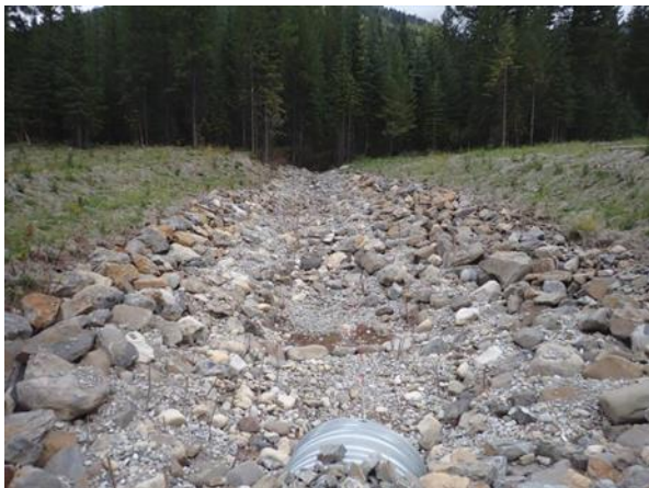
Figure 2. View of stream channel upstream from culvert in September 2023 (left), and July 2024 (right)

15 introduced species were detected in July 2023. Of these species, three noxious weeds were identified: (Canada thistle ( Cirsium arvense ), oxeye daisy ( Chrysanthemum leucanthemum ), and scentless chamomile ( Matricaria maritima ). In addition to these, a few more introduced species were observed in year 2, along with a 4 th noxious species (Annual Sow thistle ( Sonchus oleraceus )).