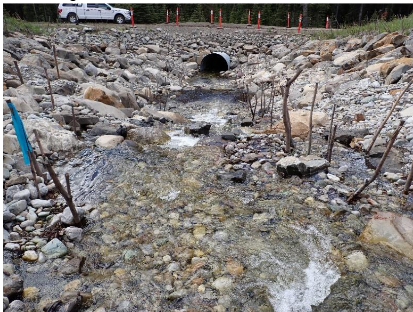
Figure 1. Looking downstream at restored stream channel with willow stakes.

In 2022, Ecofish Research Ltd. (Ecofish) provided a restoration plan to be implemented in and around a seasonal tributary in southeastern British Columbia following a washout during spring freshet. The plan was designed to address immediate erosion and sediment control (ESC) concerns and to restore the riparian and instream conditions in the tributary channel. To ensure the channel could accommodate the following spring freshet flows, the instream habitat restoration and ESC measures were implemented from October 31 to November 2, 2022. Due to the late timing of construction, implementation of the riparian revegetation component was delayed until the spring of 2023. Subsequently, Ecofish provided an Implementation Memo to describe the results obtained for early channel stability and ESC monitoring (conducted to confirm site stability and conditions appropriate to proceed with riparian planting) and as-built riparian planting surveys, marking the end of the restoration plan implementation phase. The restoration plan prescribed five years of effectiveness monitoring including annual effectiveness monitoring of three components: channel stability, ESC, and riparian revegetation. The purpose of this memorandum is to document the effectiveness of the three monitoring components as listed. Below is a summary of methods and results from monitoring in the first two years.